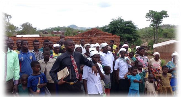
This is a church built by its congregation that needs a roof. It will cost about $500 for iron sheets.

Our challenge has been getting enough Bibles and bicycles for the pastors and their congregations. The other issue of course, is the polygamy. It is still the culture for a man to marry two or more wives in the region in which we operate. I have to say that after teaching the pastors what the book of Timothy says about the subject with regards to Deacons, Bishops, wives, etc. there have been changes across the board. Unfortunately, it has never been taught and so we have very effective pastors who can no longer hold positions of leadership in the church. They cannot put their excess wives aside for obvious reasons but nor can they continue as pastors.