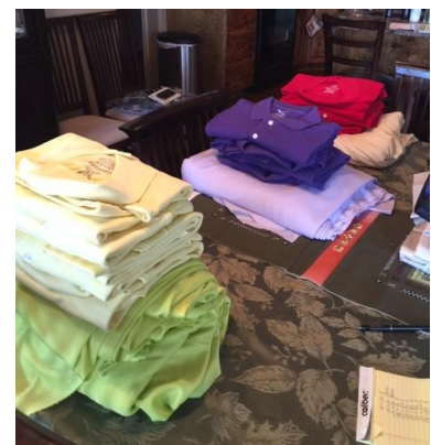
Some of the materials purchased

We were absolutely thrilled when 22 of these pastors came and requested that they be allowed to renew their vows in church as they had never been married in a church but only under tradition and custom. We plan on holding the wedding at the September Bible School. If you would like to be a part we need shoes and hats for the brides and golf shirts and pants for the grooms. It would be $20 per bride and $25 per groom. I have managed to purchase materials for the dresses and we will have a tailor make them up in Malawi.