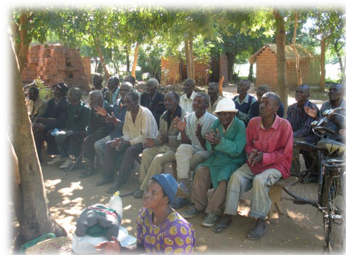
The elderly group at Marka