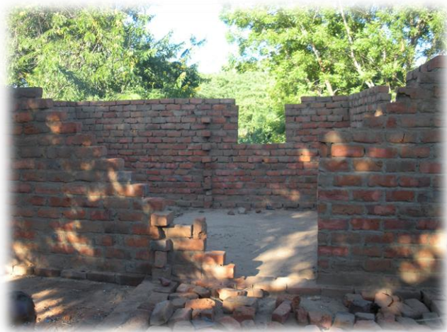
NEW HOME FOR OUR WHEEL CHAIR ELDERLY MAN

Even so, the famine in parts of the country is still severe as it rained so much their crops were washed away and rivers formed where there were no rivers before. We could not get up to Chididi in the mountains because parts of the road have been washed away and teams are going in this week to repair. There are 88 elderly there and they had to send porters down from the village to pick up 88 x 25 lb bags of ufa (maize flour) 88 x 6 lbs of dried beans and 88 blankets. They carry all this back up the mountain on their heads.