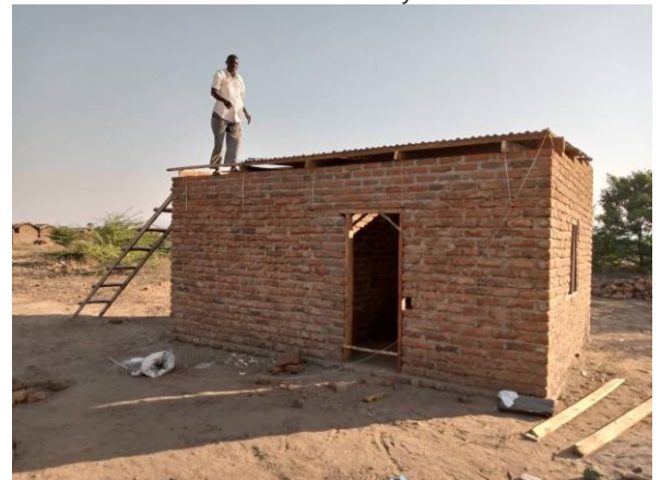
Another house almost finished