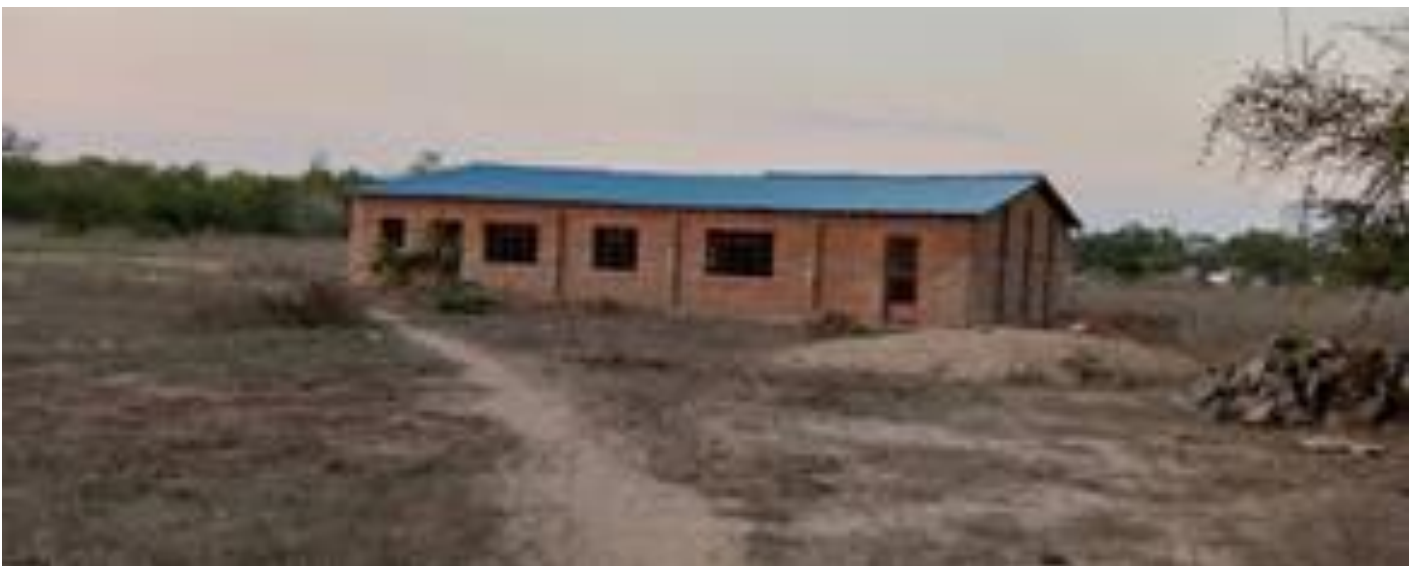
Church at Tengani needs plastering and painting

Non-Profit Organization U.S. Postage Paid Toledo, OH Permit # 522