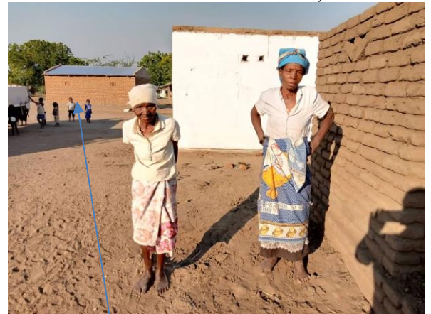
House for the elderly ladies